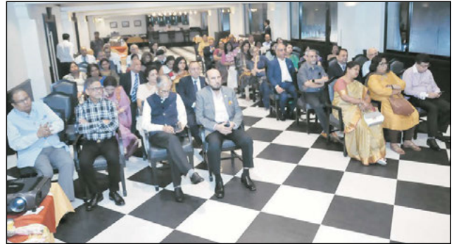
Full view of audience