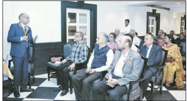
Another view of IPP Power point presentation