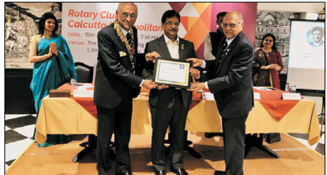
IPP handing over the Charter to President in presence of DG