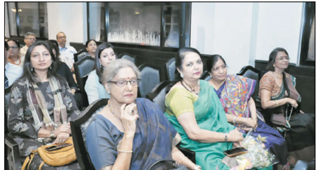
Another view of audience