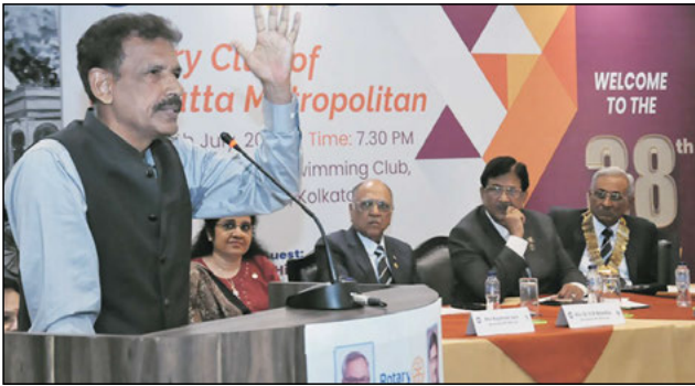
Guest of Honour delivering his address