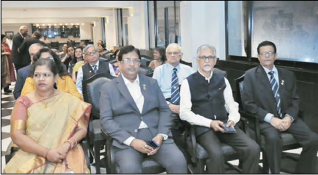
A view of guests before the start of the meeting