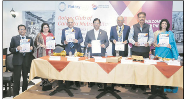
Special Edition of Metro Voice was released