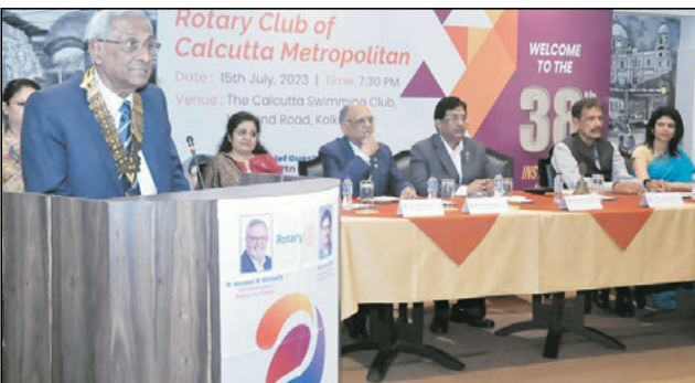
Another view of President delivering his address