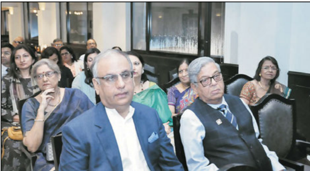
A view of audience