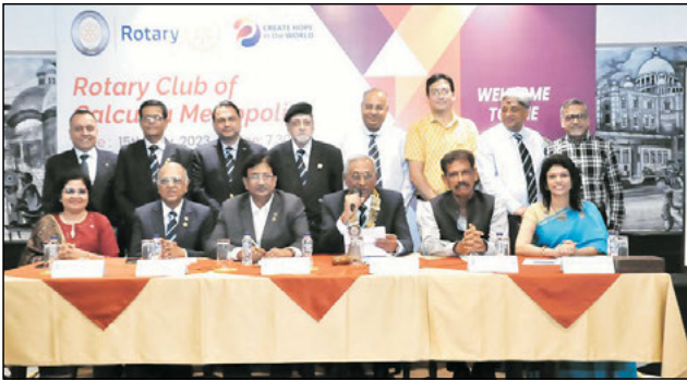
President introduced the Board for the RY-2023-2024