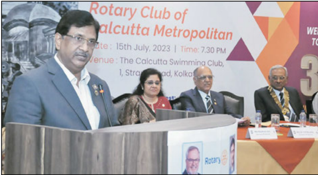
DG delivering his key note address